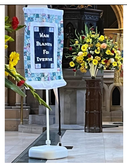
WBFE Banner on display